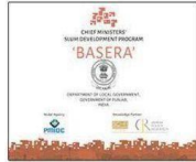
Chief Minister's Slum Development Programme