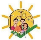
The Housing & Urban Development Department of Government of Odisha